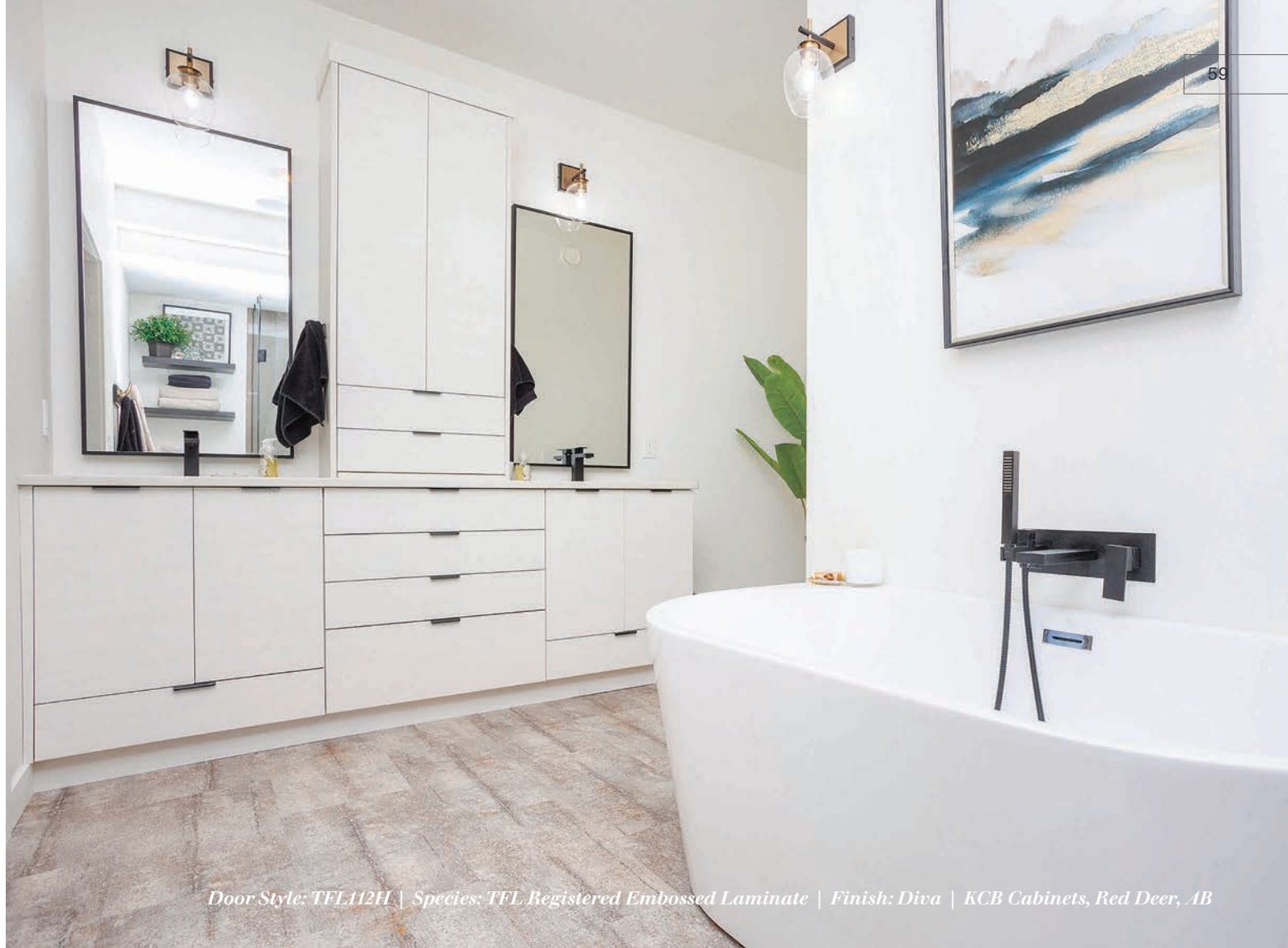
Door Style: TFL112H | Species: TFL Registered Embossed Laminate | Finish: Diva | KCB Cabinets, Red Deer, AB