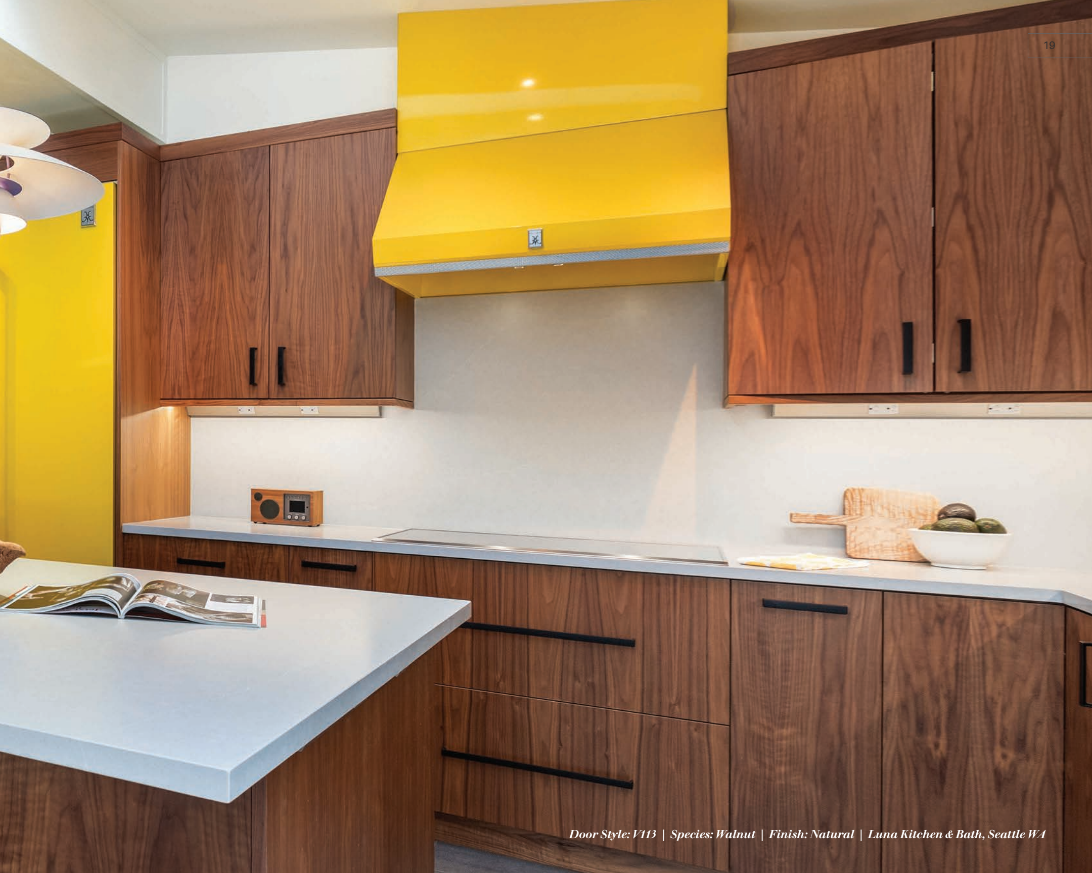
Door Style: V113 | Species: Walnut | Finish: Natural | Luna Kitchen & Bath, Seattle WA