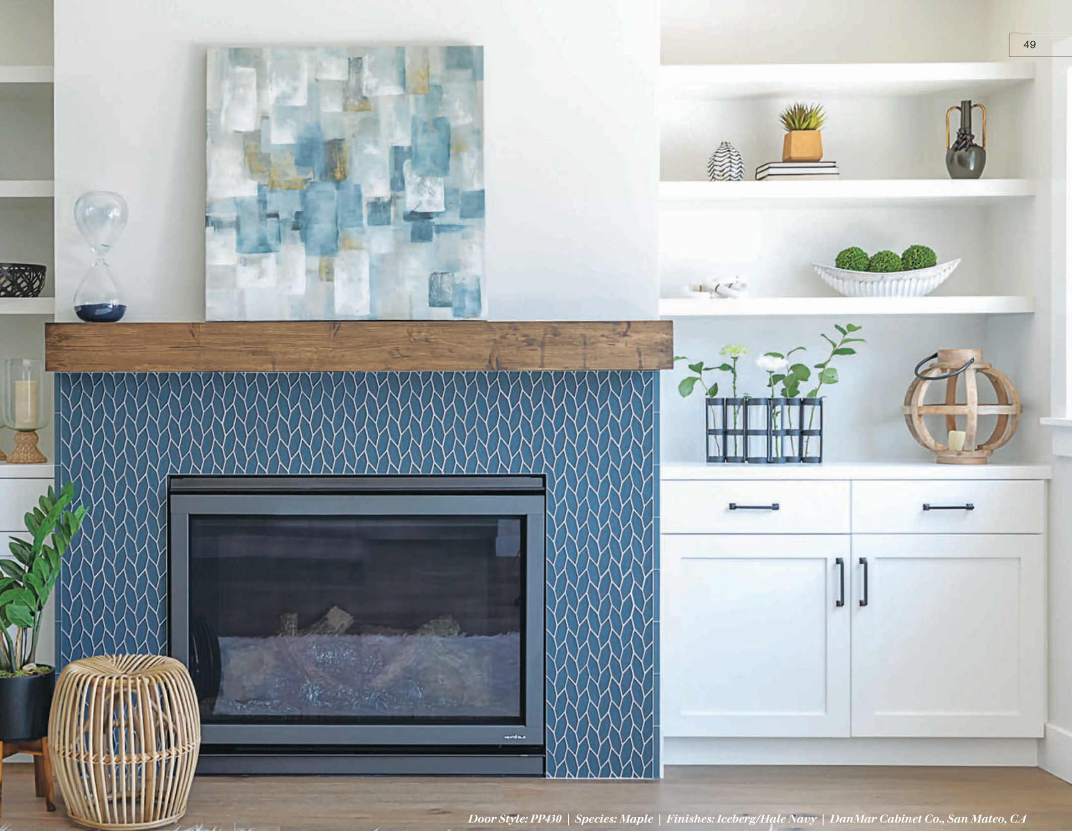
Door Style: PP430 | Species: Maple | Finishes: Iceberg/Hale Navy | DanMar Cabinet Co., San Mateo, CA