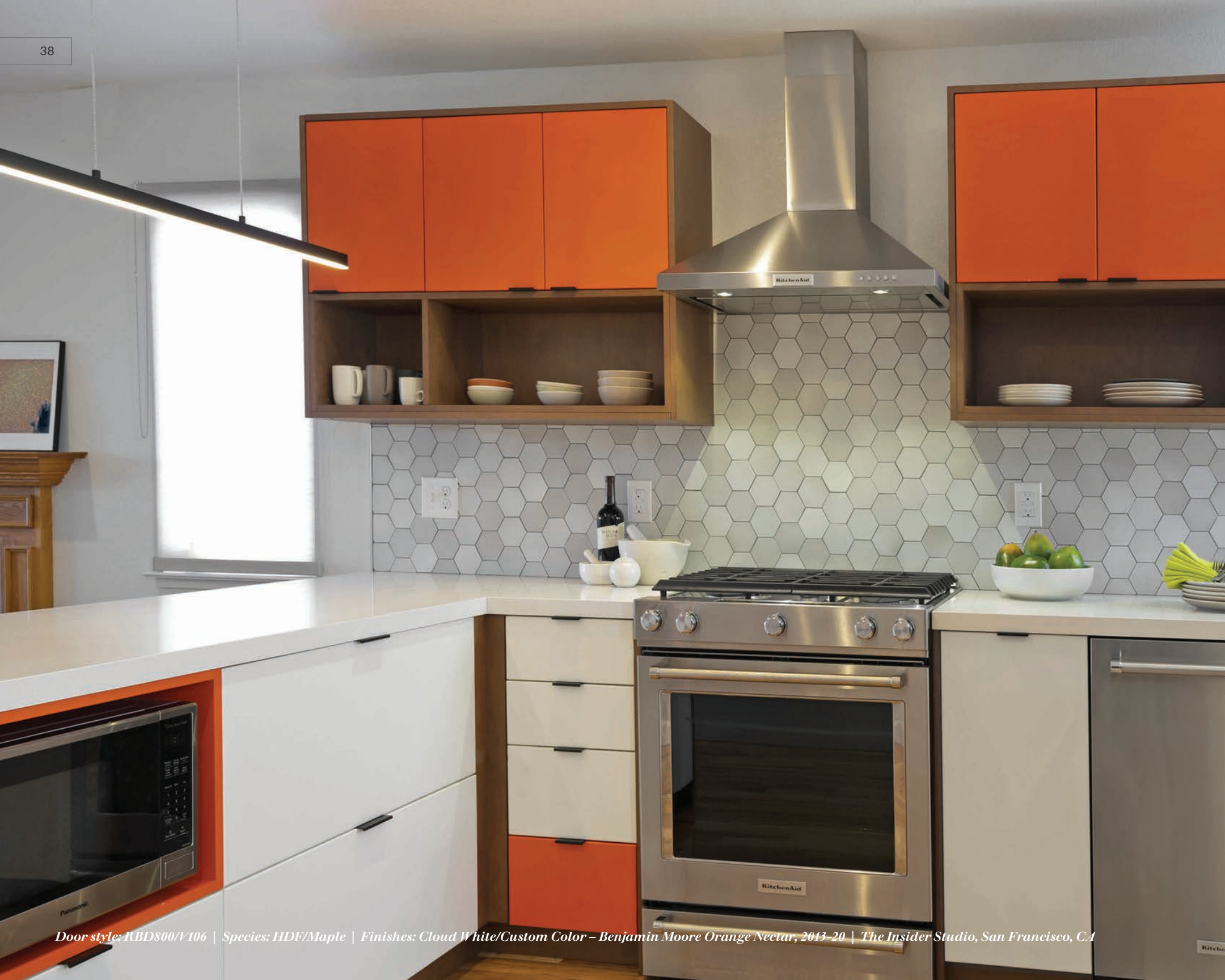
Door style: RBD800/V106 | Species: HDF/Maple | Finishes: Cloud White/Custom Color – Benjamin Moore Orange Nectar, 2013-20 | The Insider Studio, San Francisco, CA