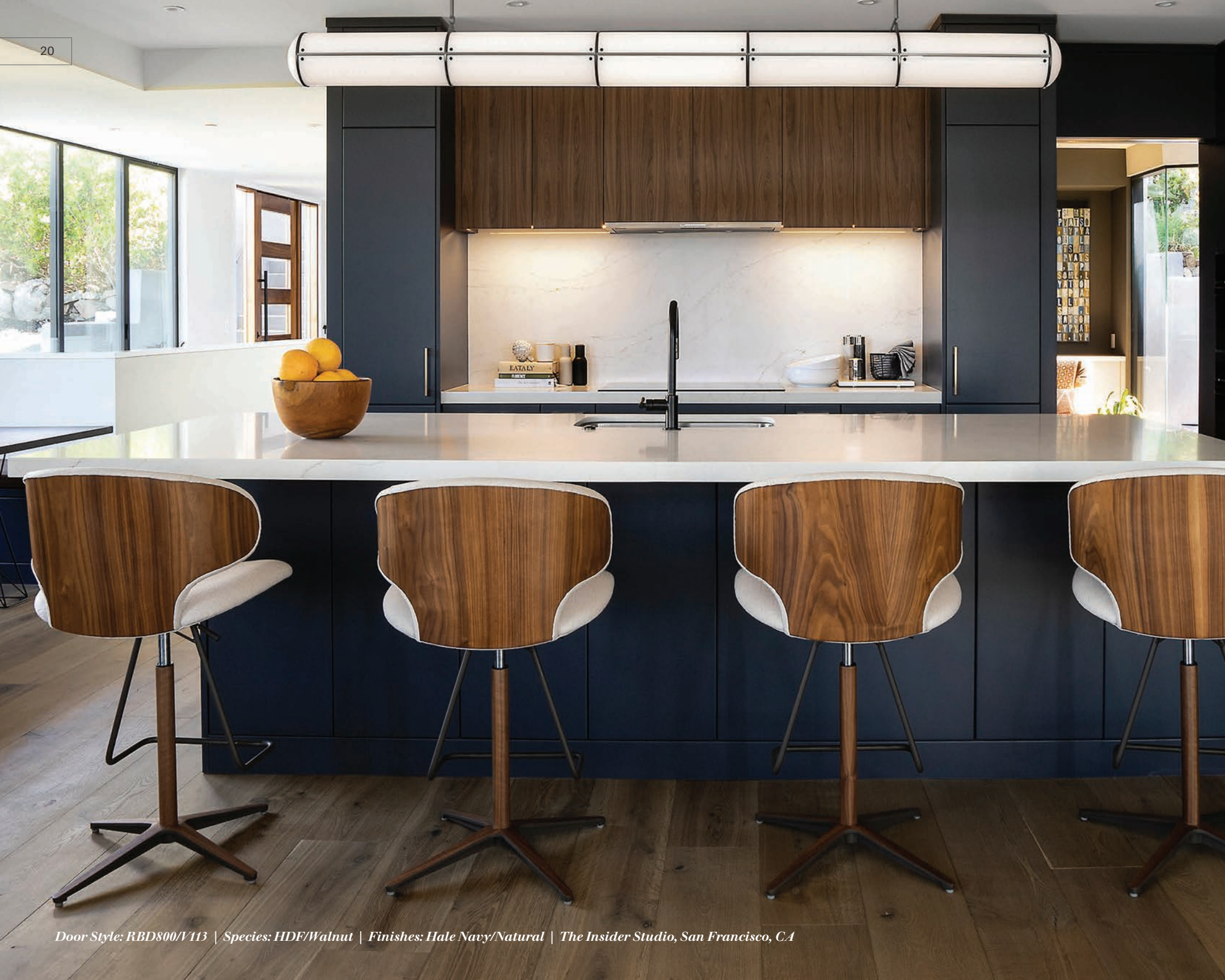
Door Style: RBD800/V113 | Species: HDF/Walnut | Finishes: Hale Navy/Natural | The Insider Studio, San Francisco, CA