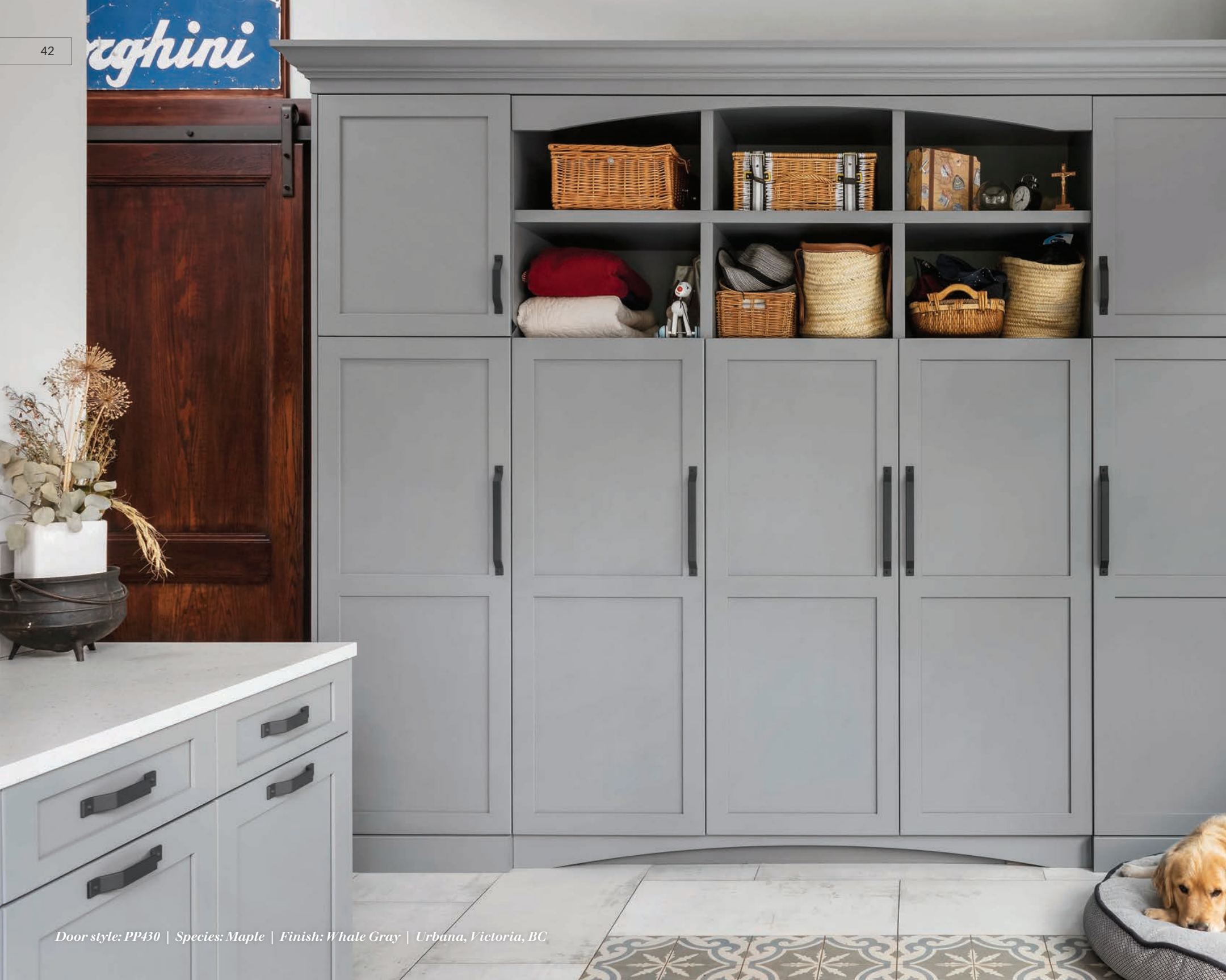
Door style: PP430 | Species: Maple | Finish: Whale Gray | Urbana, Victoria, BC