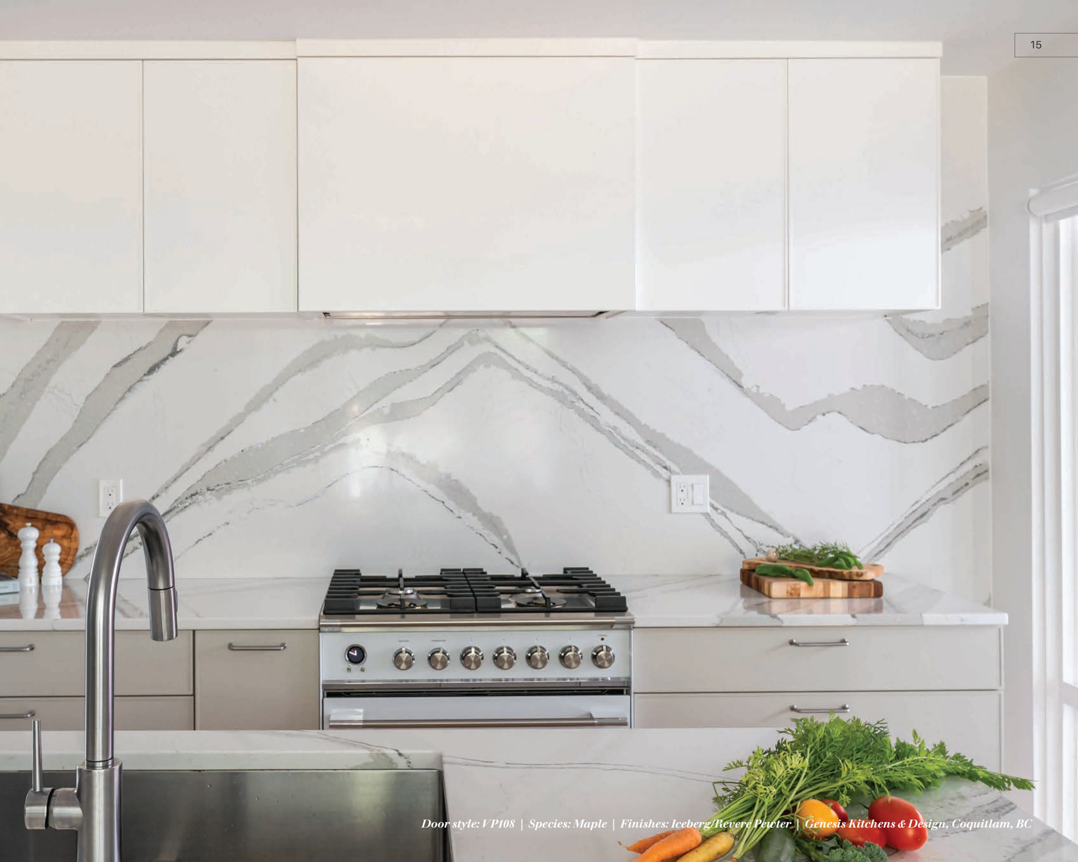
Door style: VP108 | Species: Maple | Finishes: Iceberg/Revere Pewter | Genesis Kitchens & Design, Coquitlam, BC