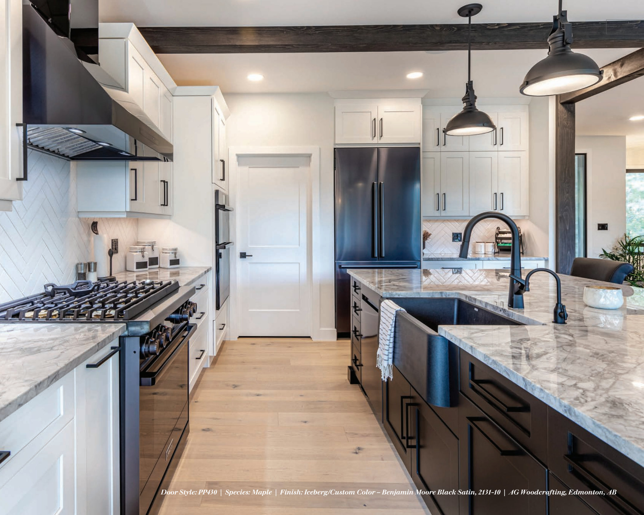
Door Style: PP430 | Species: Maple | Finish: Iceberg/Custom Color – Benjamin Moore Black Satin, 2131-10 | AG Woodcrafting, Edmonton, AB