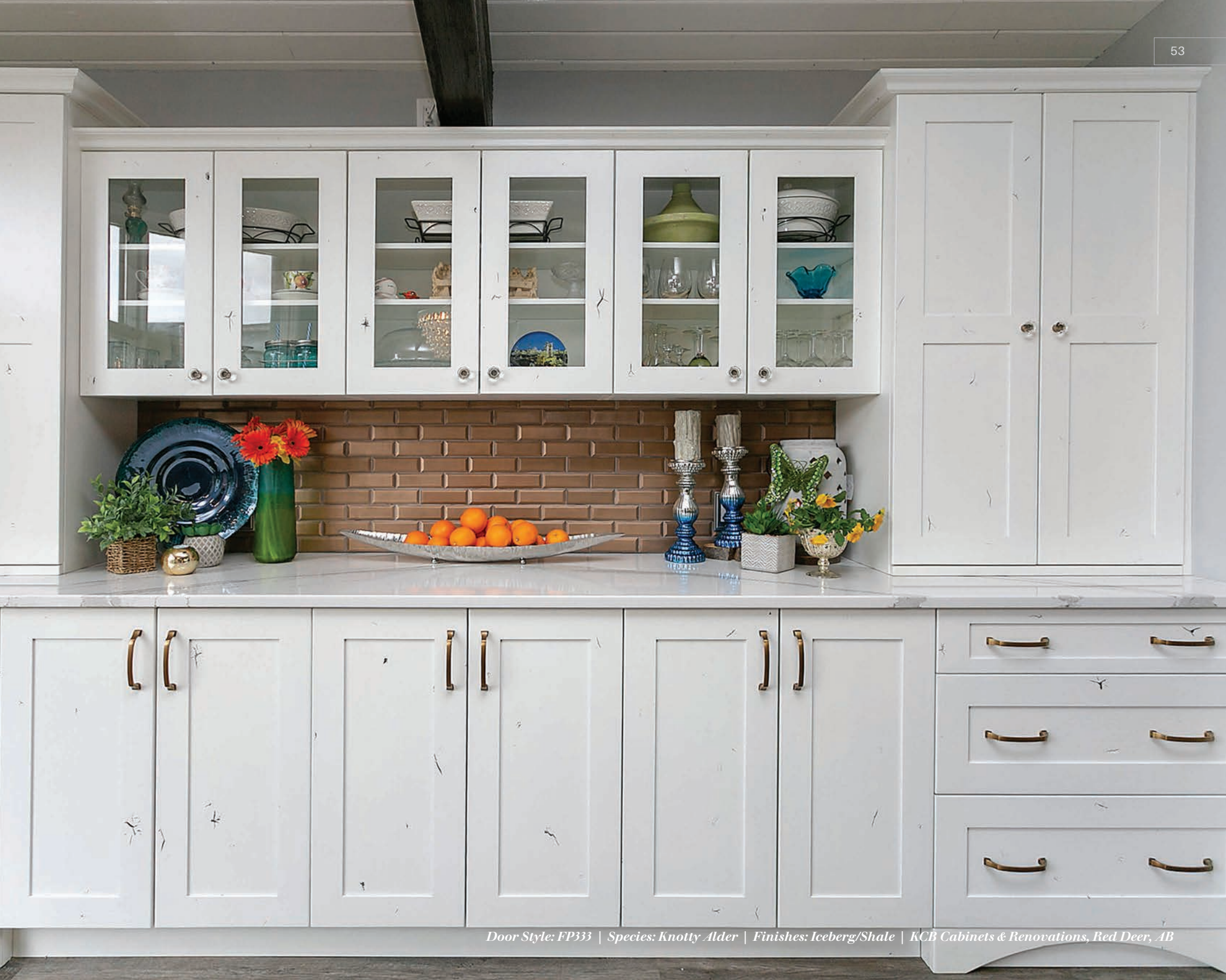
Door Style: FP333 | Species: Knotty Alder | Finishes: Iceberg/Shale | KCB Cabinets & Renovations, Red Deer, AB