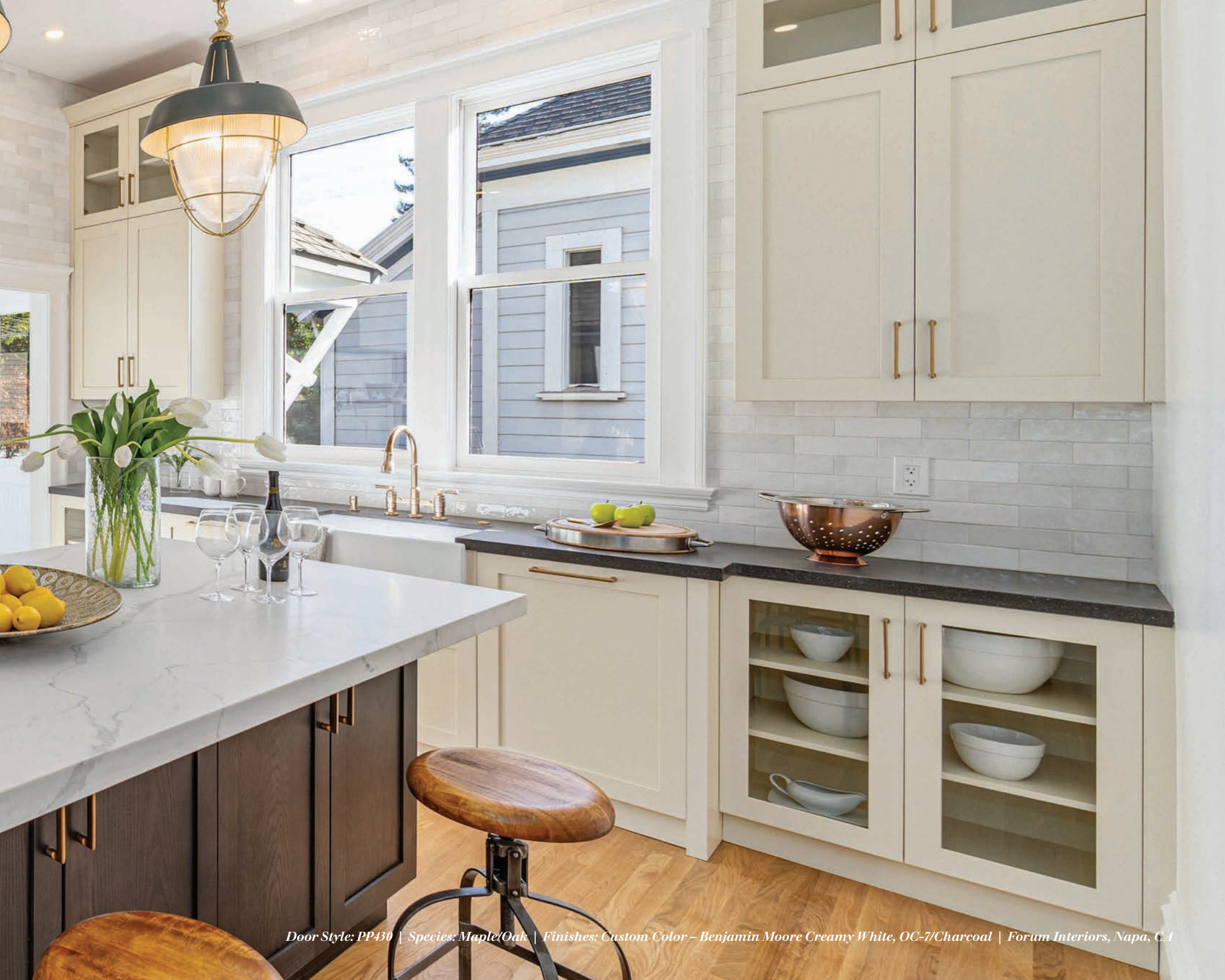
Door Style: PP430 | Species: Maple/Oak | Finishes: Custom Color – Benjamin Moore Creamy White, OC-7/Charcoal | Forum Interiors, Napa, CA