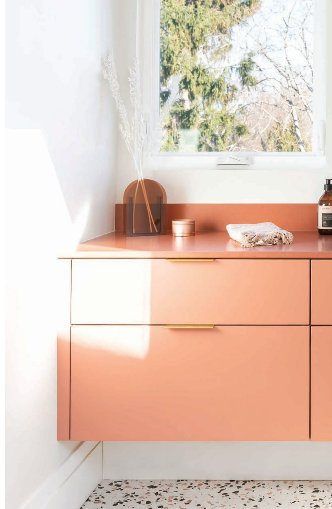
Door style: RBD800 | Species: HDF | Finish: Custom Color – Benjamin Moore Smoked Salmon, CC-154 | Urbana, Victoria, BC