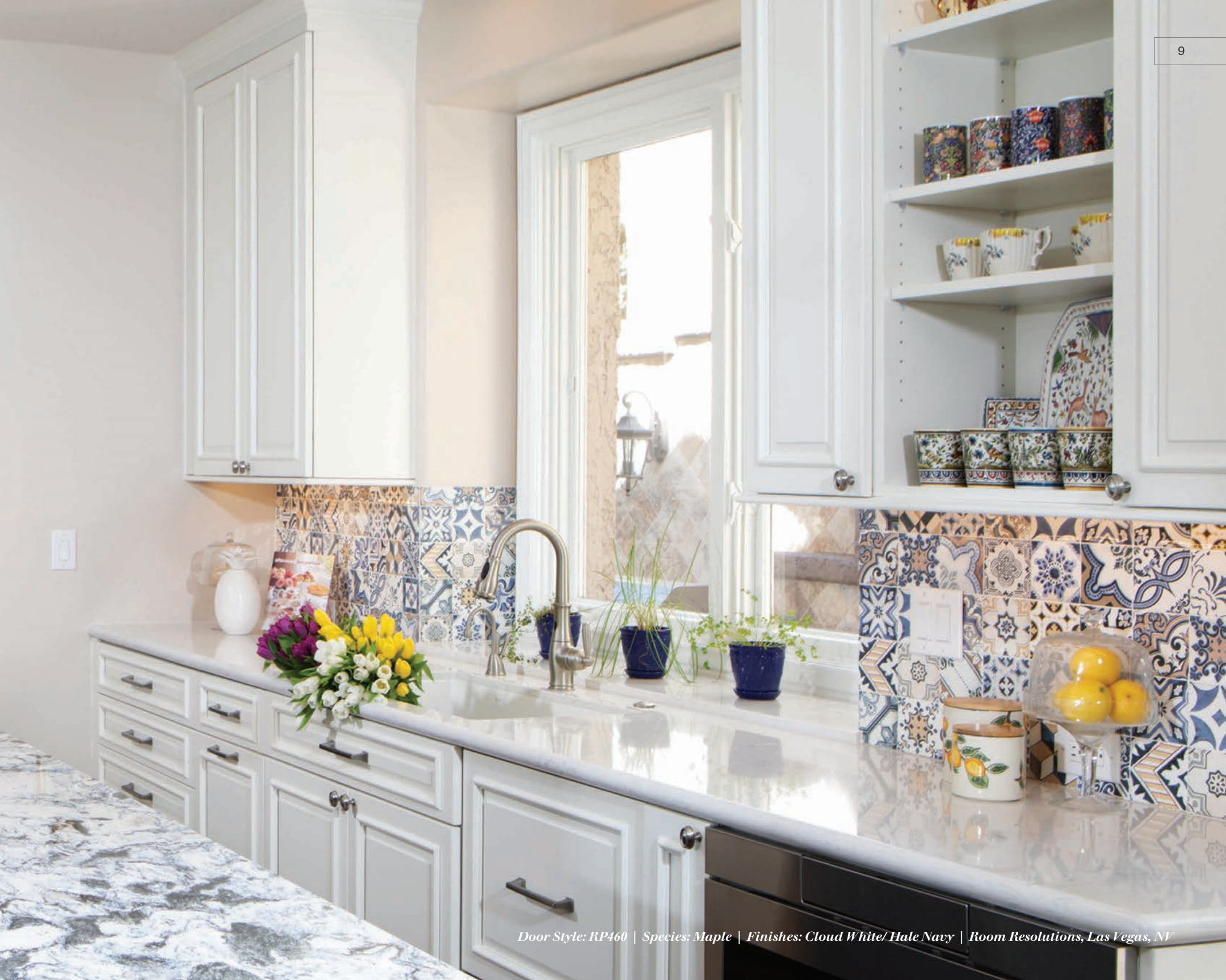
Door Style: RP460 | Species: Maple | Finishes: Cloud White/Hale Navy | Room Resolutions, Las Vegas, NV