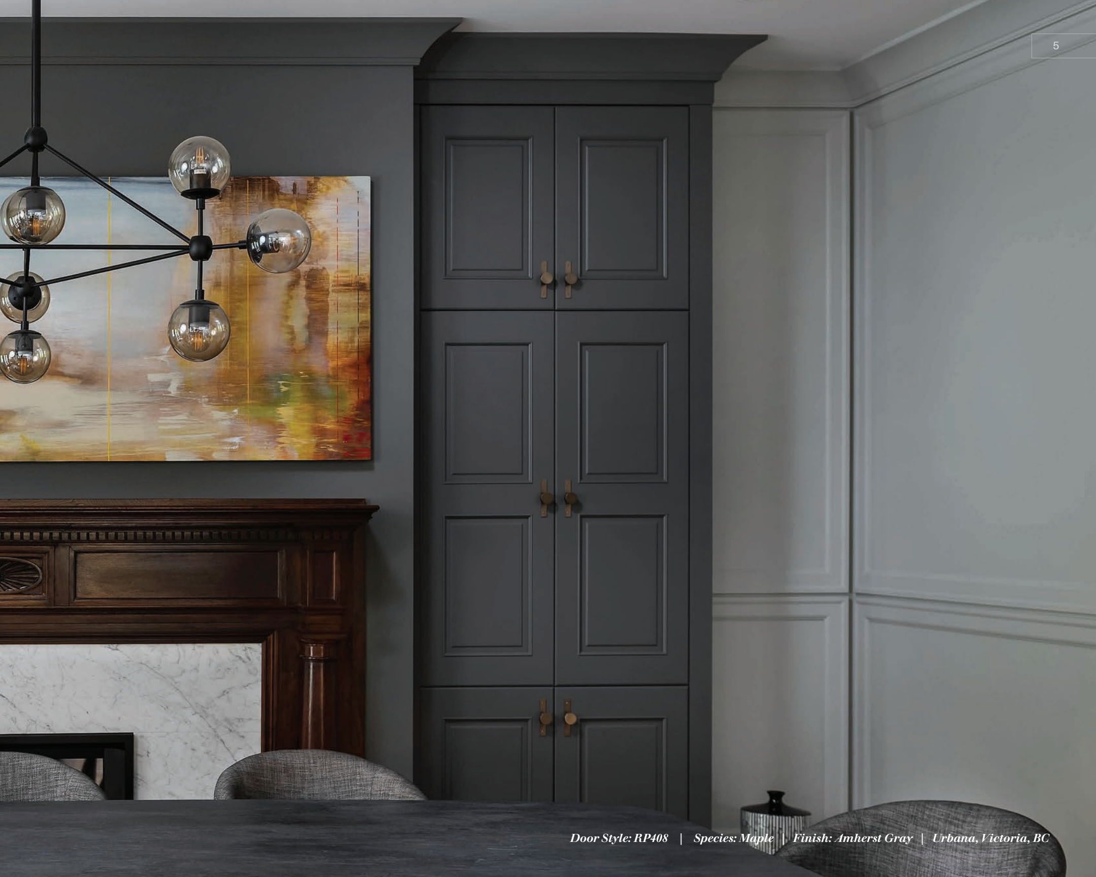
Door Style: RP408 | Species: Maple | Finish: Amherst Gray | Urbana, Victoria, BC