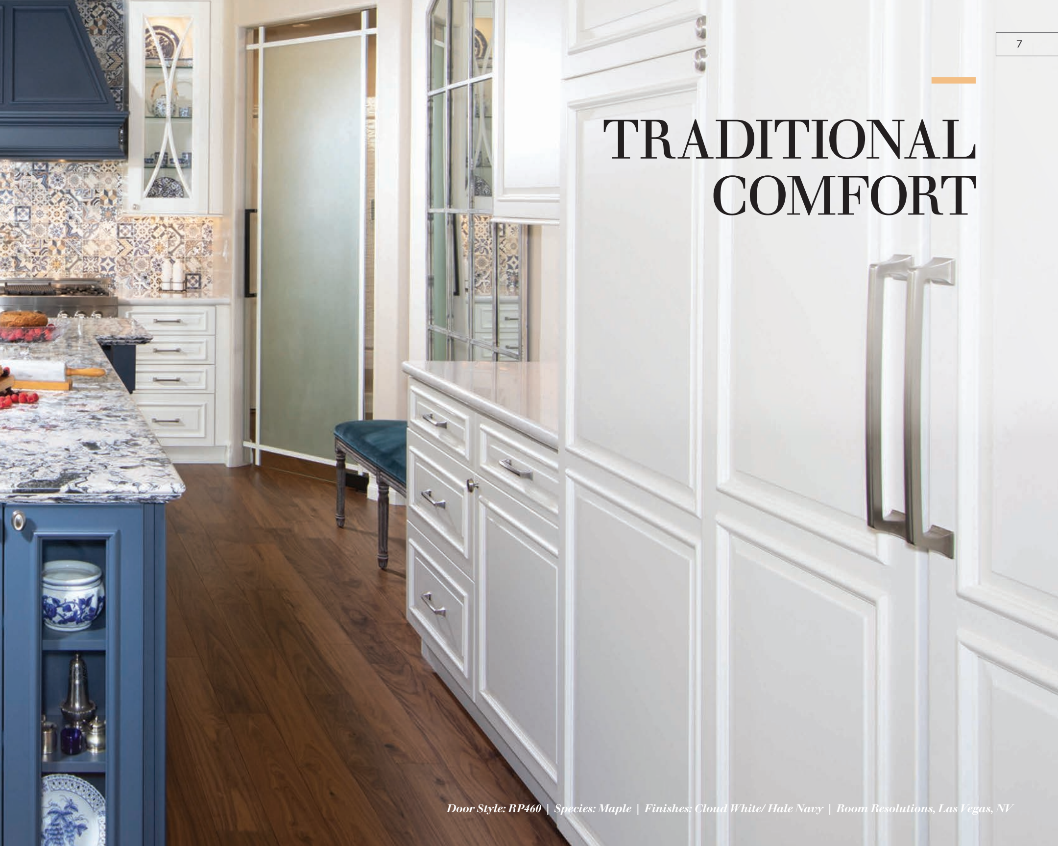
Door Style: RP460 | Species: Maple | Finishes: Cloud White/Hale Navy | Room Resolutions, Las Vegas, NV