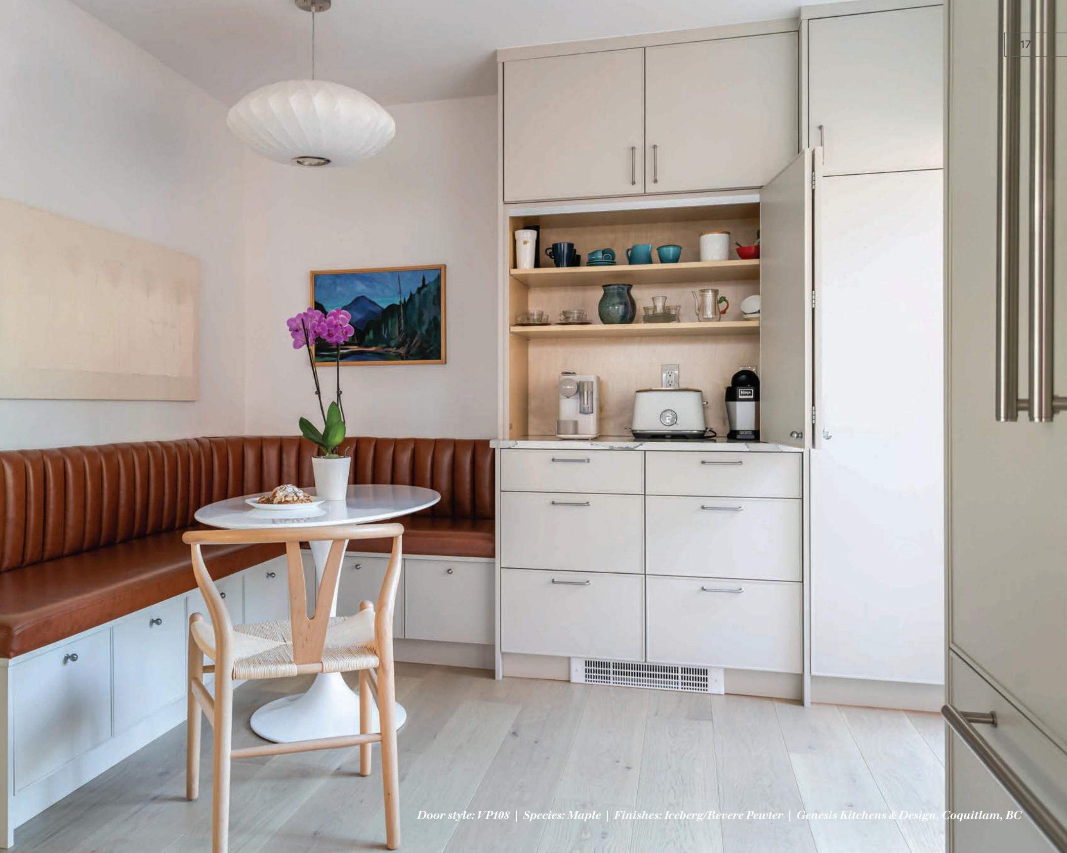
Door style: VP108 | Species: Maple | Finishes: Iceberg/Revere Pewter | Genesis Kitchens & Design, Coquitlam, BC