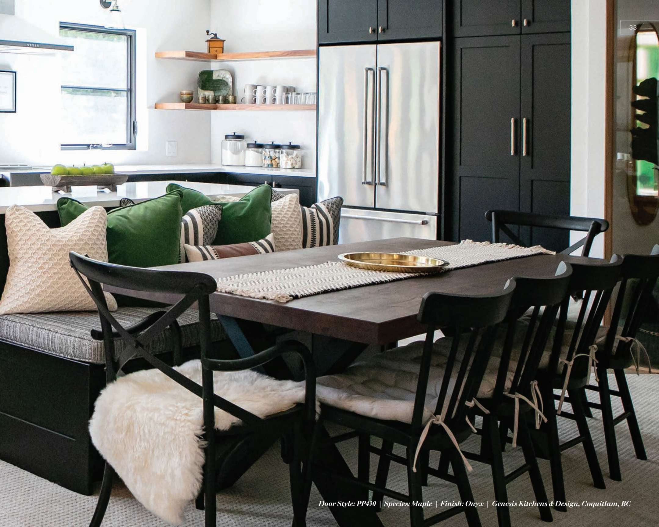
Door Style: PP430 | Species: Maple | Finish: Onyx | Genesis Kitchens & Design, Coquitlam, BC