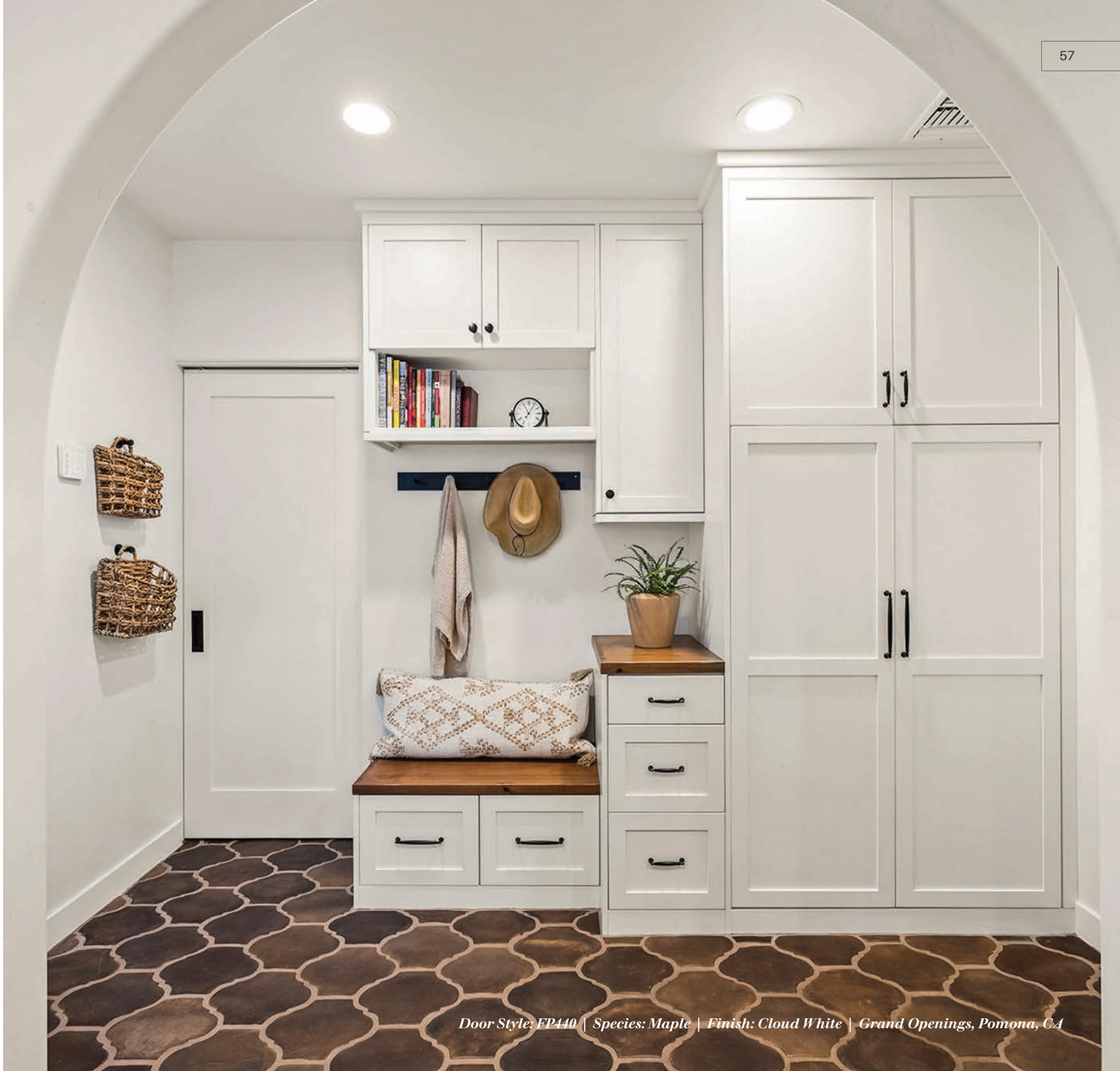
Door Style: FP440 | Species: Maple | Finish: Cloud White | Grand Openings, Pomona, CA