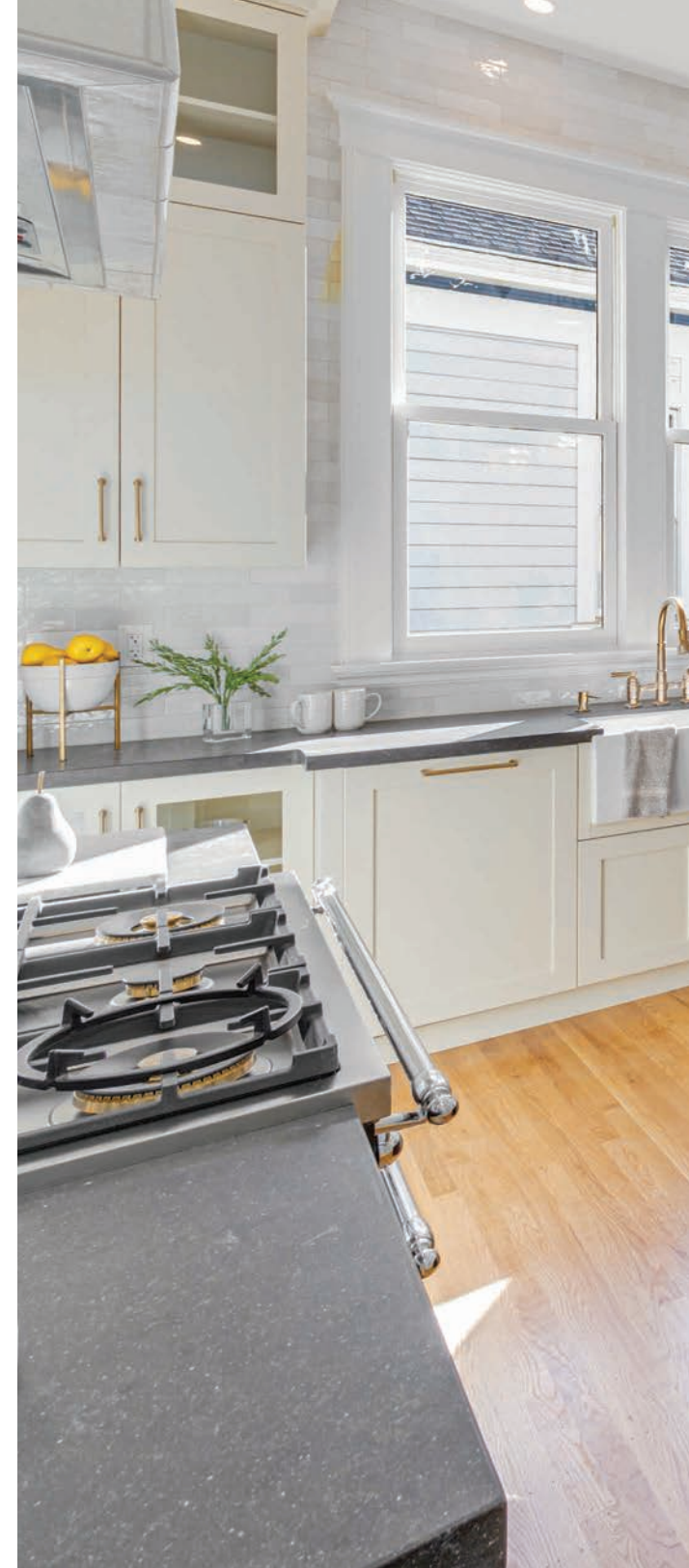
Door Style: PP430 | Species: Maple/Oak | Finishes: Custom Color – Benjamin Moore Creamy White, OC-7/Charcoal | Forum Interiors, Napa, CA